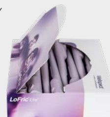
User-friendly customer box.

**Effective length, length of the catheter that can be inserted into the body.